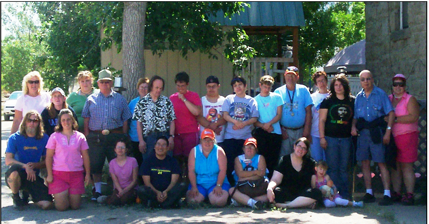
The SMR crew of clients and staff begin a six day round trip rail vacation to Oregon's coast.

A nature park is planned for the acre sized front yard at SMR, providing a place close to the Day Program and the main building for those using wheelchairs and walkers who want to get outside and enjoy nature. A proposed water feature, paved pathways, and benches and tables will welcome folks to sit outside, have coffee, and visit with one another. Donations for this project will be accepted from those donors wishing to commemorate special events, to remember loved ones who have passed away, or to support the efforts of Spring Meadow Resources in providing the highest quality of services available in the field of developmental disabilities. If you are interested in this project, please call Tiffany at 443.2376, or send an e-mail to