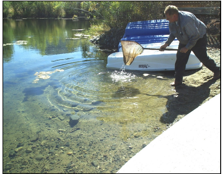
Rainbow trout fingerlings and some large rainbows were stocked in the SMR Pond in mid-September by Spring Creek Hatchery in Lewistown.