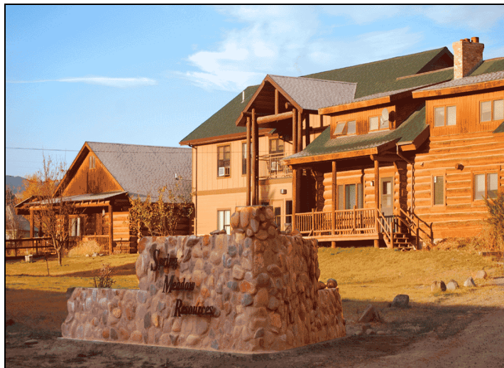
Spring Meadow Resources’ new stone entry. Since this photo, the entry was joined with new split rail cedar fencing.

Whether it is drive-in movie night behind the main building in the summer with friends, or a camp out and boating out at Canyon Ferry, the folks in SMR’s services enjoy life to the best of their abilities.