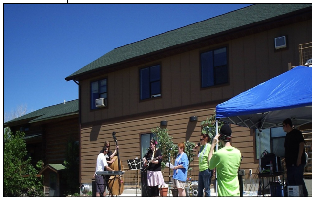
Some of the folks from SMR who performed during the second annual Music at the Meadow Festival in June.

Spring Meadow Resources constantly strives to incorporate those activities that will enrich the lives of the individuals we serve in all aspects of community life, be it work or play.